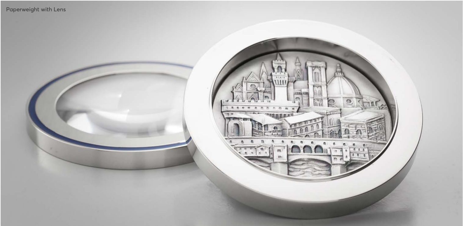
Paperweight with Lens