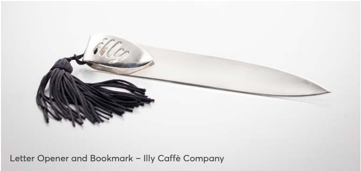
Letter Opener and Bookmark – Illy Caffè Company