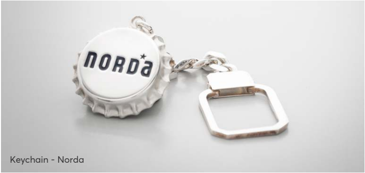
Keychain - Norda