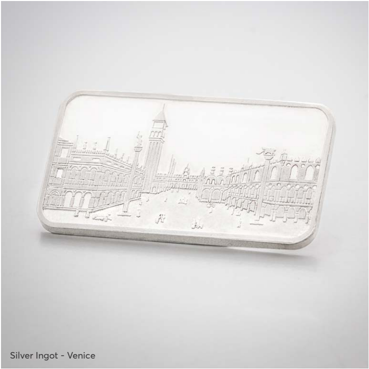
Silver Ingot - Venice